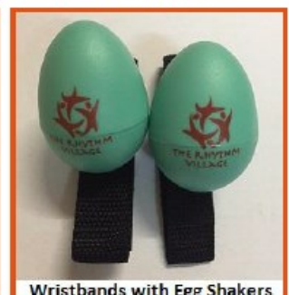
Wristbands with Egg Shakers