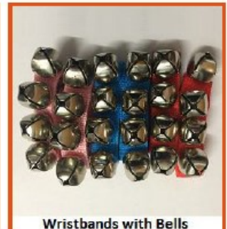
Wristbands with Bells